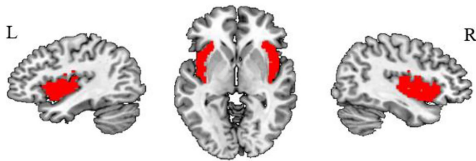
Fig. 1 The seed region of the insula per hemisphere in the Anatomical Automatic Labeling (AAL) atlas